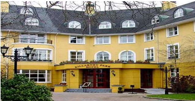
KILLARNEY PARK HOTEL - KILLARNEY

The Killarney Park Hotel is one of the finest 5-star luxury hotels Ireland has to offer. Perfectly located in the heart of Killarney town centre.