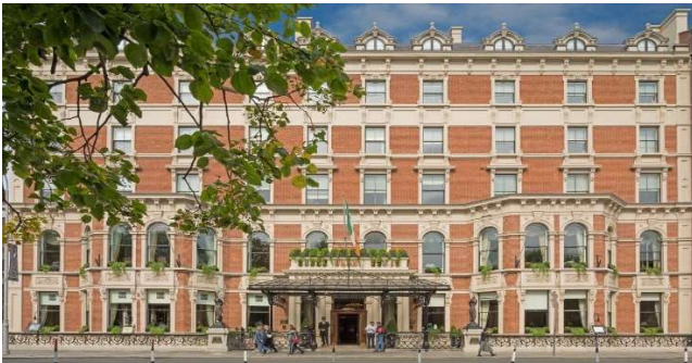
THE SHELBOURNE HOTEL - DUBLIN

Experience the elegance and luxury of The Shelbourne Dublin, A Renaissance Hotel. This exceptional five-star hotel, set in a hundred-year-old majestic building, is the premier city centre hotel in Dublin.