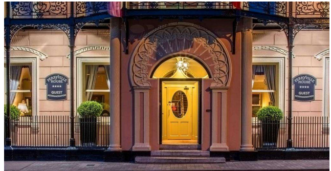
PERRYVILLE HOUSE - KINSALE