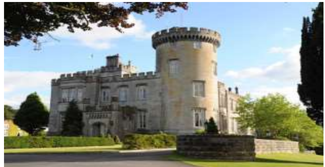
DROMOLAND CASTLE - NEWMARKET ON FERGUS

Ireland's most magical address, Dromoland Castle, has been welcoming guests since the 16th century. The 5-star ancestral home of the O'Brien's of Dromoland, whose lineage dates back 1,000 years to Brian Boru, one of the last High Kings of Ireland.