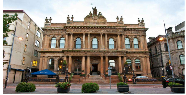
THE MERCHANT HOTEL - BELFAST

The AA 5 Red Star Merchant Hotel in Belfast is situated in the heart of Belfast city centre's historic Cathedral Quarter. The grandeur of the original Grade A listed building is complemented by an elegant Art Deco inspired wing with a multitude of exciting amenities.