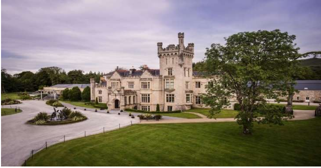
LOUGH ESKE CASTLE - DONEGAL TOWN

Lough Eske Castle, a five-star castle hotel located on a secluded lakeside estate just outside Donegal Town, has a rich history dating back to the 1400s.