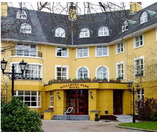
KILLARNEY PARK HOTEL - KILLARNEY

The Killarney Park Hotel is one of the finest 5-star luxury hotels Ireland has to offer. Perfectly located in the heart of Killarney town centre.