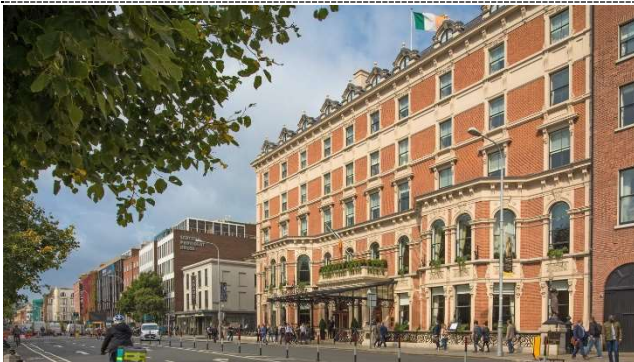
THE SHELBOURNE HOTEL - DUBLIN

Experience the elegance and luxury of The Shelbourne Dublin, A Renaissance Hotel. This exceptional five-star hotel, set in a hundred-year-old majestic building, is the premier city centre hotel in Dublin.