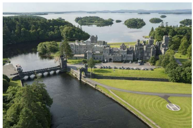
ASHFORD CASTLE - CONG

The magnificent 5-star Ashford Castle is located on the picturesque shores of Lough Corrib. Dating back to 1228, enjoy legendary Irish hospitality at its best.